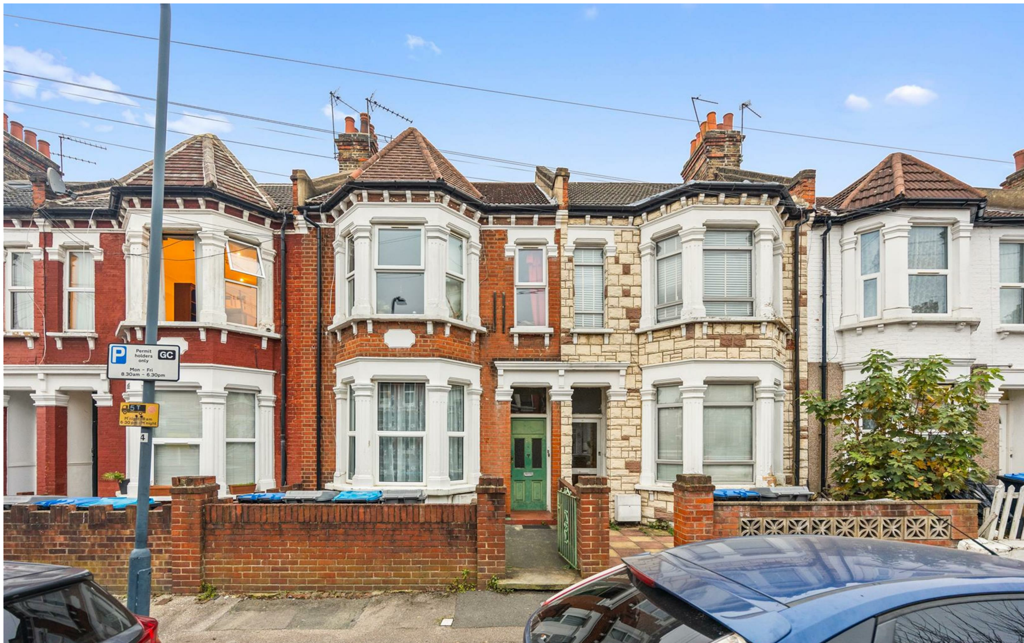
Osborne Road NW2